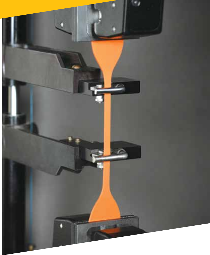
The PPG Monroeville Business and Technical Center houses a full-scale pilot plant and testing laboratory, including tensile testing equipment.

Together, these materials and equipment enable PPG scientists and technical service experts to replicate the entire product development process – from experimental silica manufacturing to production, testing and analysis of customized rubber compounds.